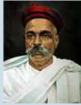
LOKMANYA BAL GANGADHAR TILAK