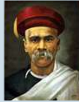
GOPAL GANESH AGARKAR