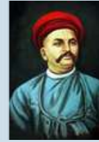
VAMAN SHIVRAM APTE