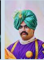
RAJARSHI SHAHU MAHARAJ